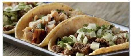
Please ask about additional favorites

(prices based per person) Pozole 3 Elote Cups 3 Churros 3